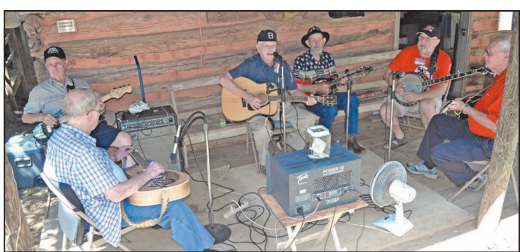
A view from last year's 67th Annual Georgia Mountain Fair.