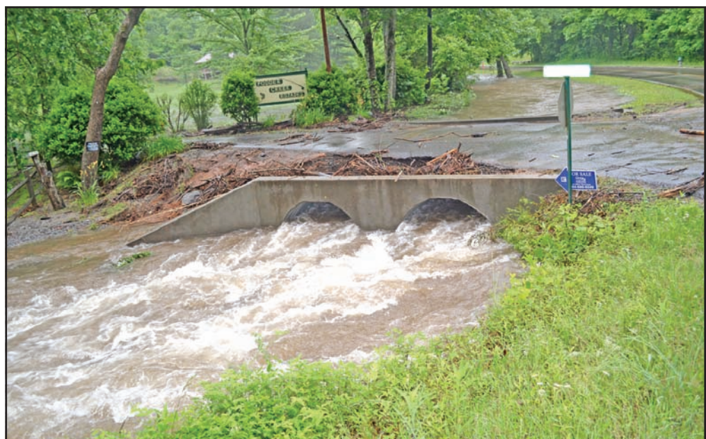
Raging floodwaters out at Fodder Creek Estates on Wednesday, May 30.