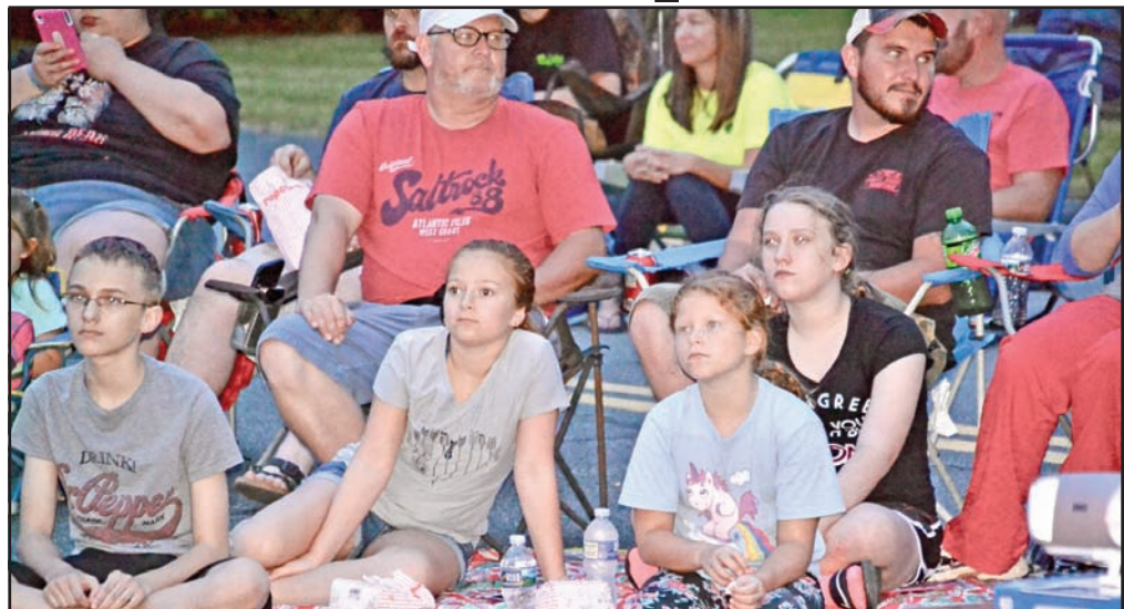
Local folks got comfortable on the Hiwassee Town Square to watch the movie "Ferdinand" on May 25.