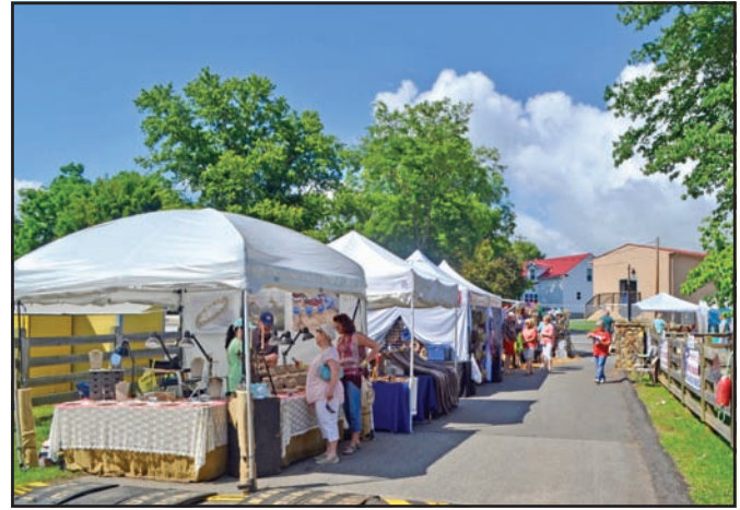
The Third Annual North Georgia Highlands Seafood Festival took place for three days last weekend in Young Harris Mayor's Park.